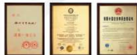
国家一级企业证书 ISO9001 质量体系认证证书 ISO10012 计量体系认证证书