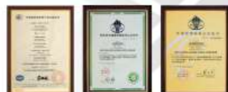
3C强制性产品认证证书 职业安全健康管理体系认证证书 环境管理体系认证证书

地址: 中国江苏徐州市铜山路165号 Add.No.165 Tongshan Road Xuzhou Jiangsu China 电话(Tel): 0516-83462242 83462350 传真(Fax): 0516-83461669 邮编(Post Code): 221004 网址(URL): http://www.xzxc.com.cn E-mail: xzxcyx@pub.xz.jsinfo.net 服务电话(Service Tel): 0516-83461183 服务传真(Service Fax): 0516-83461180 质量监督电话 (Quality Inquiry Tel): 0516-87888268 备件电话(Spare Parts Tel): 0516-83461542 大修厂(Overhaul Factory): 0516-83461904